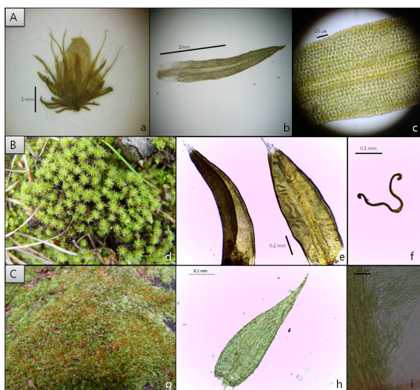
Fig. 2. Newly recorded species for the Korean flora. A. Diphyscium perminutum Takaki a. plant. b. leaf. c. median leaf cells; B. Racomitrium japonicum Dozy & Molk. d. plants. e. leaves. f. cross-sections of leaves; C. Isopterygium minutirameum (Müll. Hal.) A. Jaeger. g. plants. h. leaf. i. pseudoparaphylla.

3 moss species Diphyscium perminutum Takaki, Racomitrium japonicum Dozy & Molk., and Isopterygium minutirameum (Müll. Hal.) A. Jaeger. collected from Dongbaek-dongsan, are new additions to the bryophyte flora of Korea (Appendix 1, Fig. 2). The descriptions of these 3 taxa are as follows.