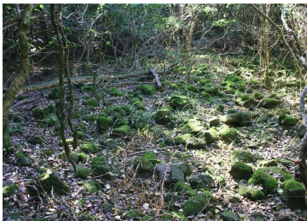
Fig. 4. A panoramic photo of swamp.